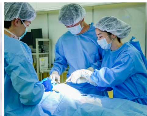
Left: Training in Faculty of Health Care and Nursing Right: Training in Faculty of Medicine