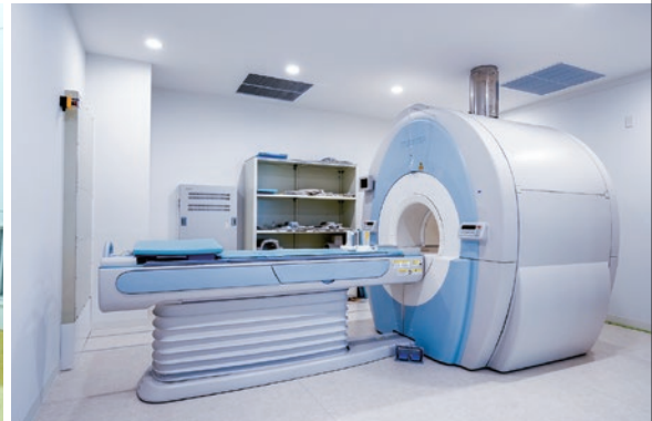
Left: da Vinci Surgical System Right: Tesla superconducting type MRI scanner